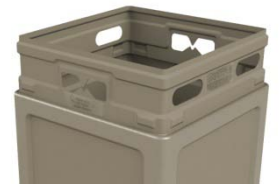
Patented Grab Bag™

Square waste container has a sleek and contemporary style with a snap lid closure and patented Grab Bag™ system to secure trash bag in place for a cleaner appearance. These heavy-duty waste containers are designed to withstand the harshest environments! Receptacle is perfect for indoor or outdoor use.