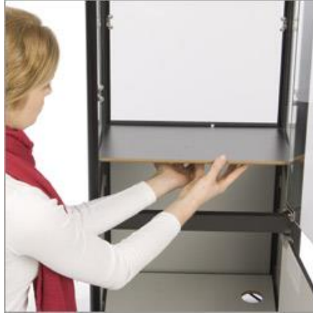
Fit the base of the showcase area into the case.