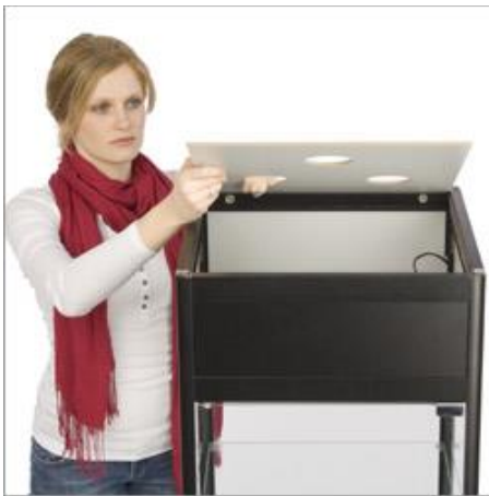
Place the top panel of the showcase so the holes line up with the lights for ventilation.