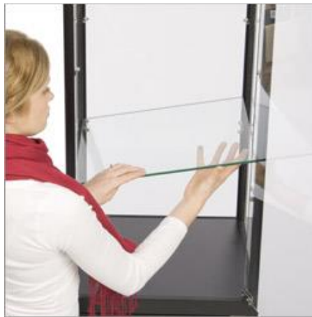
Insert the three tempered glass shelves. If needed, adjust height of shelf clips with included screwdriver.