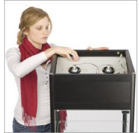
Insert light panel diagonally from inside case*. Lower right rear corner (side with switch) to bottom lip, then lower left rear corner. Once both sides are in place, lower front side (panel opposite door). Connect wire output from showcase to light panel wires.