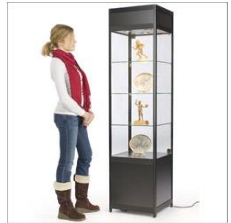
Your showcase is now complete and ready to be filled with merchandise!

*Please Note: Repetitive insertion of light panel may cause small chips to the laminate covering of the panel. These damages are small and are hidden once the panel is in place.