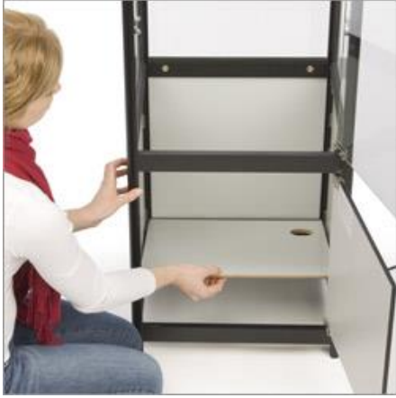
Fit the bottom cabinet's base into the case.