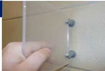
Place unit on desired area with the anchors provided (make sure holes