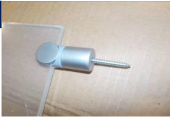
Tighten the cap back on to the standoff