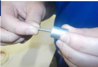
Depicted above is the screw in the standoff fully