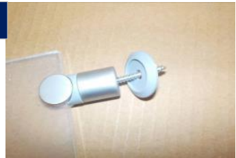
Place plastic cap provided onto the screw the the ingroove of standoff facing down on barrel of standoff