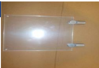
Depicted is the correct attachment of standoff into acrylic signage