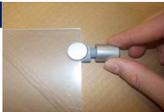
Loosen up cap on standoff