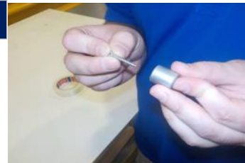
Place drywall screw provided into standoff