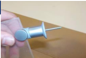
Depicted above is the correct way unit should look to this point