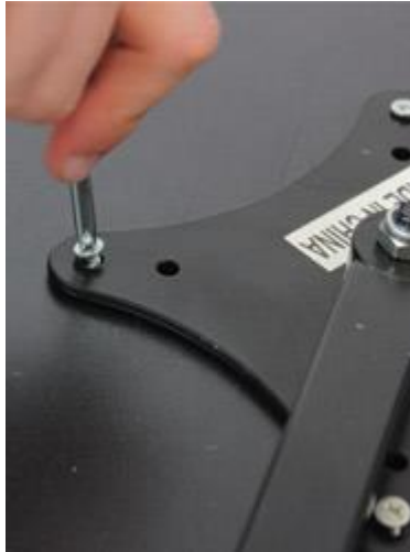
Place shelf face down, and line up base plate with predrilled holes. Use short screws to secure in place.