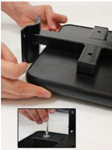
Place the second shelf top face down, and line up bracket mount with predrilled holes, place washers on top of holes, and secure with long screws.