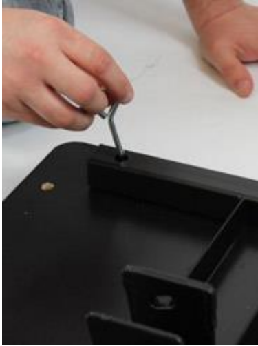
Screw in short bolts to secure shelf mount bracket.