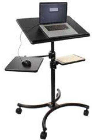
Your stand is now complete!