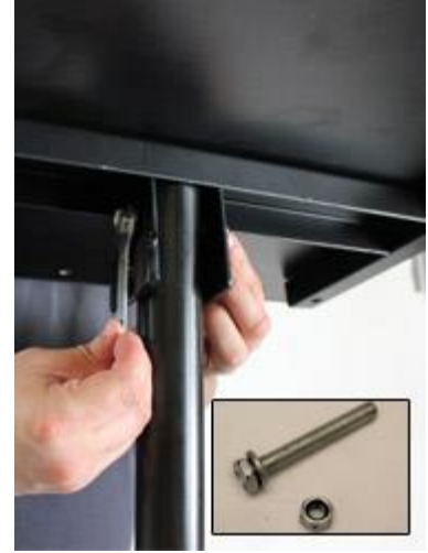
Use the pictured nut and bolt to secure the base through the upper hole and tighten with provided wrench. Please note the shelf will still be loose at this point.