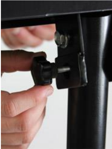
Twist the knob to lower hole. This knob can be loosened to adjust tilt surface of the display.