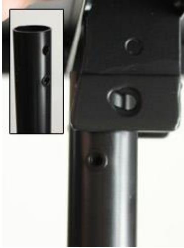
Line the shelf up on top of the pole, making sure the two picture sides line up.