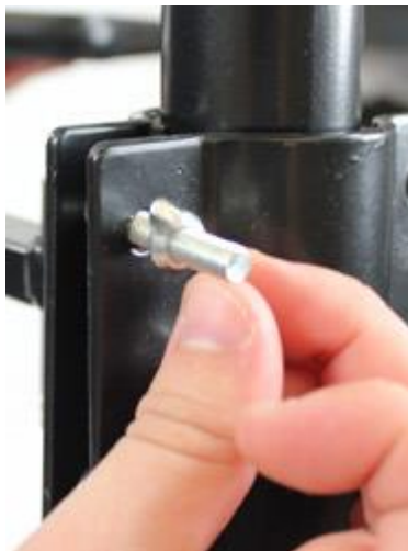
Line up second shelf bracket and secondary bracket anywhere on pole, then use four bolts and wing nuts to secure into place. Shelf can be adjusted at any time.