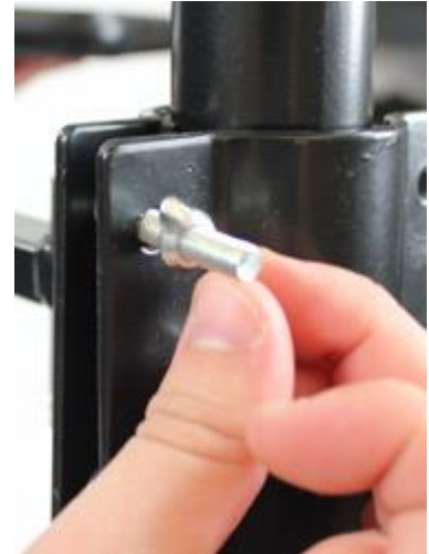
Line up shelf bracket and secondary bracket anywhere on pole, then use four bolts and wing nuts to secure into place. Shelf height can be adjusted at any time.