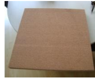
Cork Board X 1