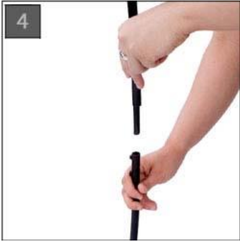
Attach the curved bar into the top connectors