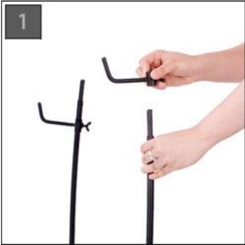
Slide the two hooks into the frame