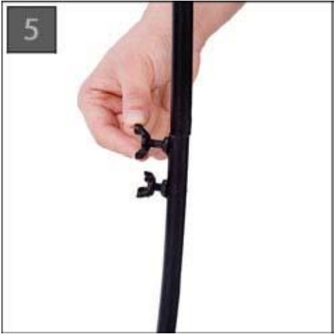
Tighten the two screws