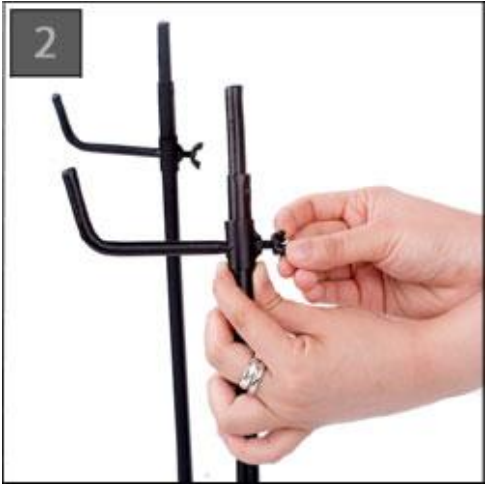
Tighten the screws from behind to hold the hooks in position