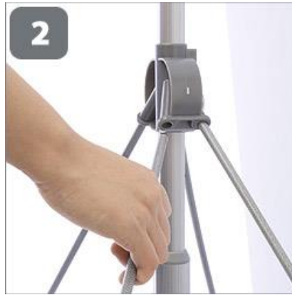
2 Insert all 4 arms into the center pole.