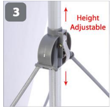
3 Press the silver clip down to adjust the height.