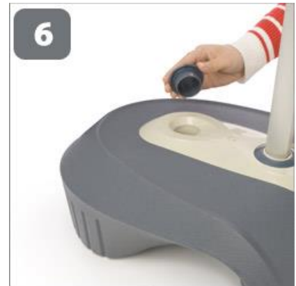
6 Be sure to fill the base with either water or sand for added weight.