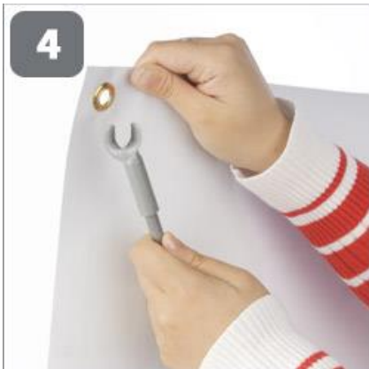
4 Attach the grommets of the banner to the hooks.