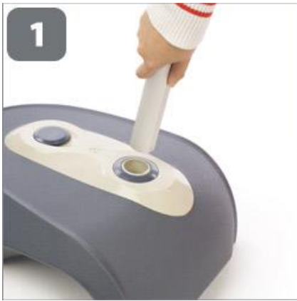
1 Insert the pole into the water base.